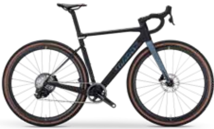
BLACK, GREY; MATT - COLOR CODE V1