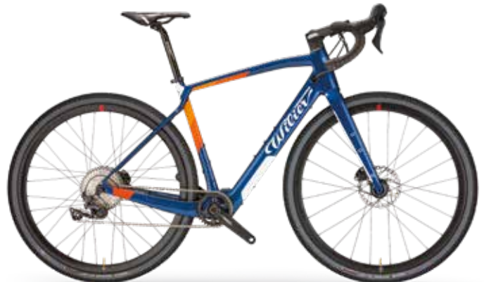
BLUE, ORANGE; GLOSSY - COLOR CODE Y8