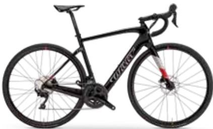
BLACK, GREY, RED; GLOSSY - COLOR CODE Y14