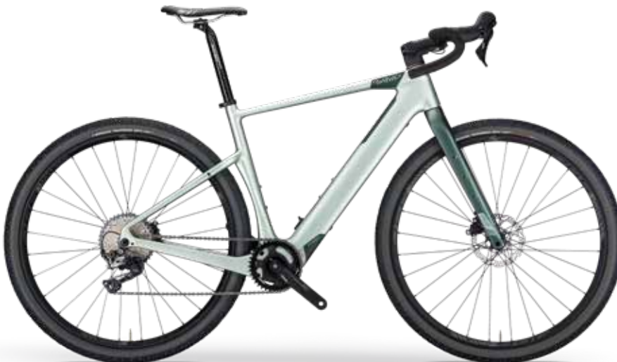
MINT GREEN; MATT - COLOR CODE Y24