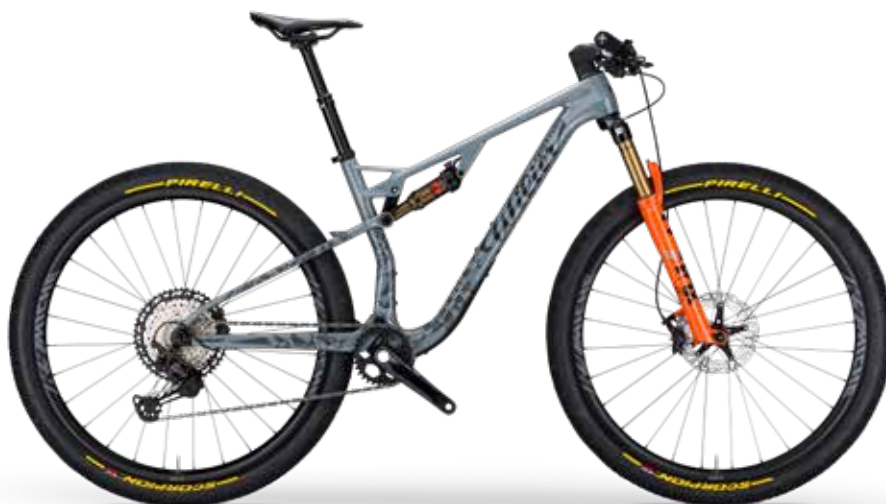
LIGHT GREY; GLOSSY - COLOR CODE U11