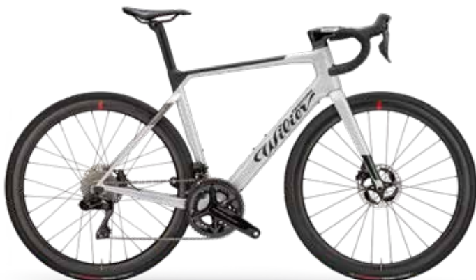
SILVER; MATT & GLOSSY - COLOR CODE Y18