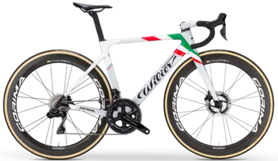
CAMPIONE ITALIANO; GLOSSY - COLOR CODE F16 NEW COLOR