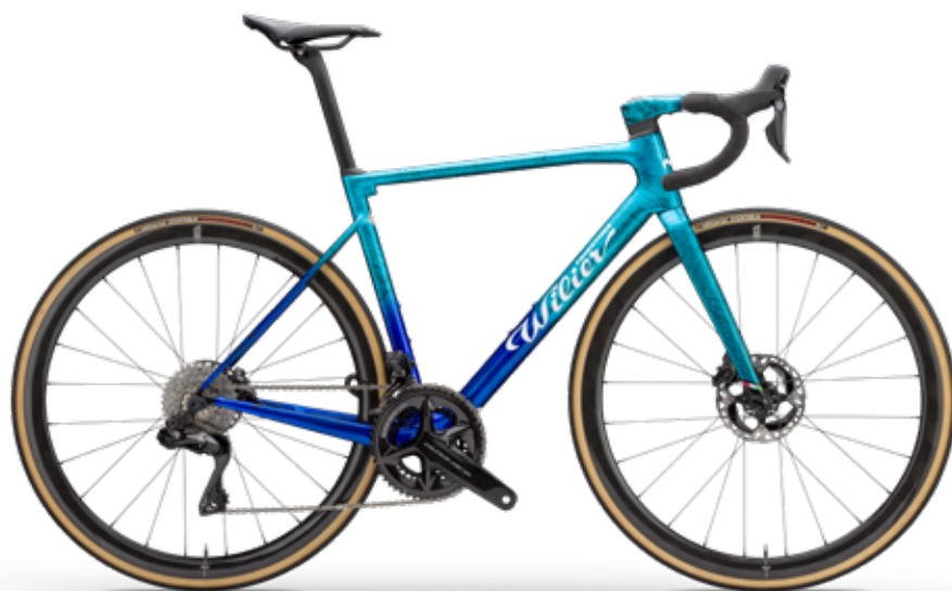
ASTANA; GLOSSY - COLOR CODE E15