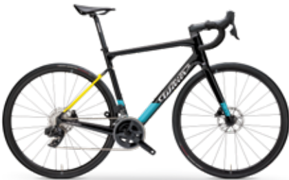
BLACK, ASTANA BLUE; GLOSSY - COLOR CODE G35