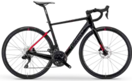
BLACK, RED; GLOSSY - COLOR CODE Y21