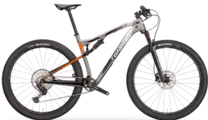
GREY, BLACK, ORANGE; GLOSSY - COLOR CODE H9