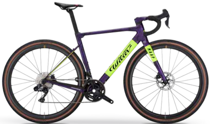
IVAR SLIK / MAAP; MATT - COLOR CODE V7 NEW COLOR