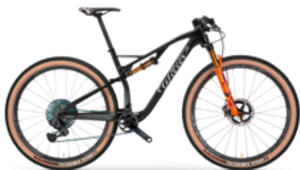
BLACK; MATT - COLOR CODE U1

┌ URTA INTEGRATED CARBON BAR - 285 G ± 3%