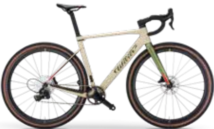
SAND, GREEN; MATT - COLOR CODE V2