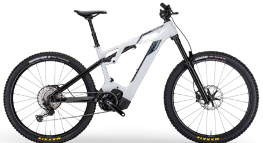
SILVER; GLOSSY - COLOR CODE P13