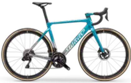
ASTANA; GLOSSY - COLOR CODE F9