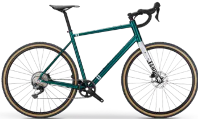
GREEN, GREY; GLOSSY - COLOR CODE J26 NEW COLOR