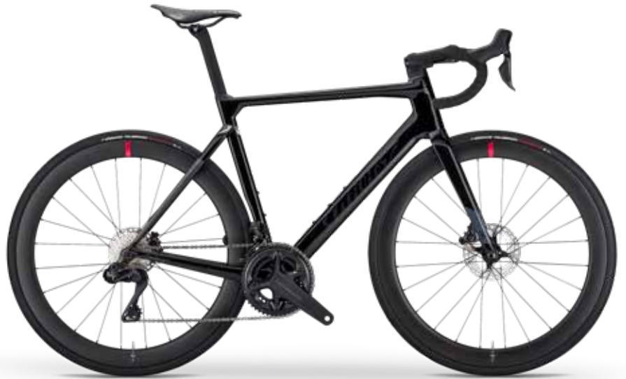
BLACK; GLOSSY - COLOR CODE F11