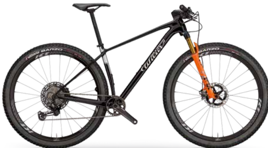
BLACK, SILVER; GLOSSY - COLOR CODE U6