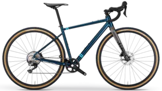
BLUE, GREY; GLOSSY - COLOR CODE J25 NEW COLOR