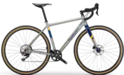
IRIDE KAKI, BLUE, YELLOW; GLOSSY - COLOR CODE J22 NEW COLOR