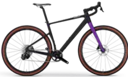
BLACK, PURPLE; MATT - COLOR CODE C8