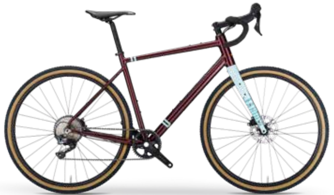
BROWN, LIGHT BLUE; GLOSSY - COLOR CODE J27 NEW COLOR