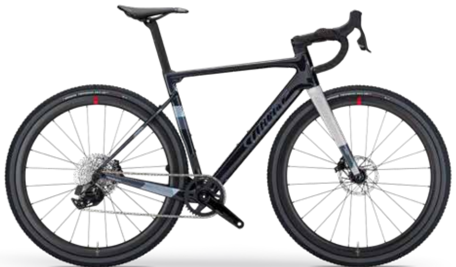
BLACK, SILVER; GLOSSY - COLOR CODE V5