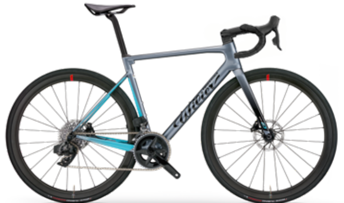
GREY, LIGHT BLUE; GLOSSY - COLOR CODE E9