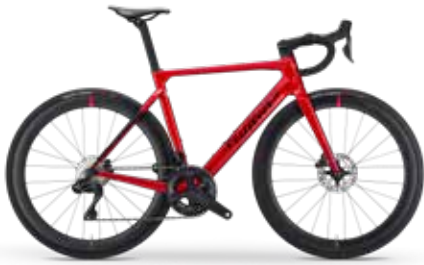
RED, BLACK; GLOSSY - COLOR CODE F15