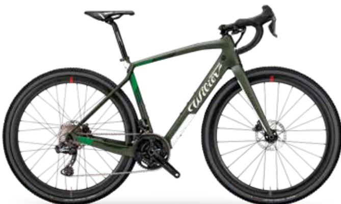
GREEN, WHITE; MATT - COLOR CODE Y9