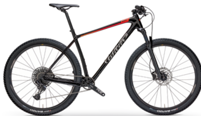
BLACK, RED, ORANGE; GLOSSY - COLOR CODE X16