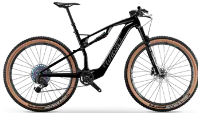
BLACK, GREY; GLOSSY - COLOR CODE U7