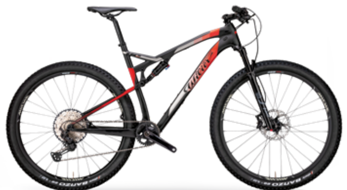
BLACK, RED; MATT - COLOR CODE H7