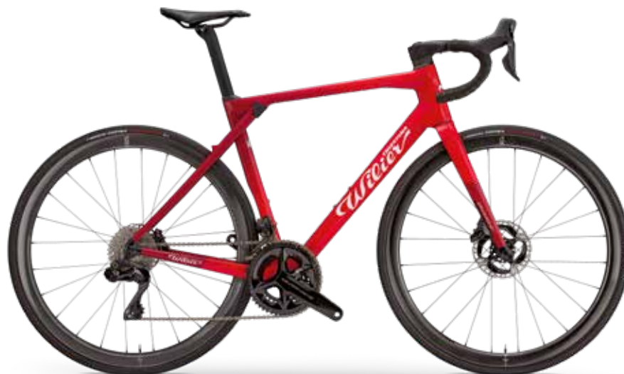
FADED RED, WHITE; GLOSSY - COLOR CODE R8