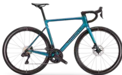
IRIDE PETROLEUM; GLOSSY - COLOR CODE E14