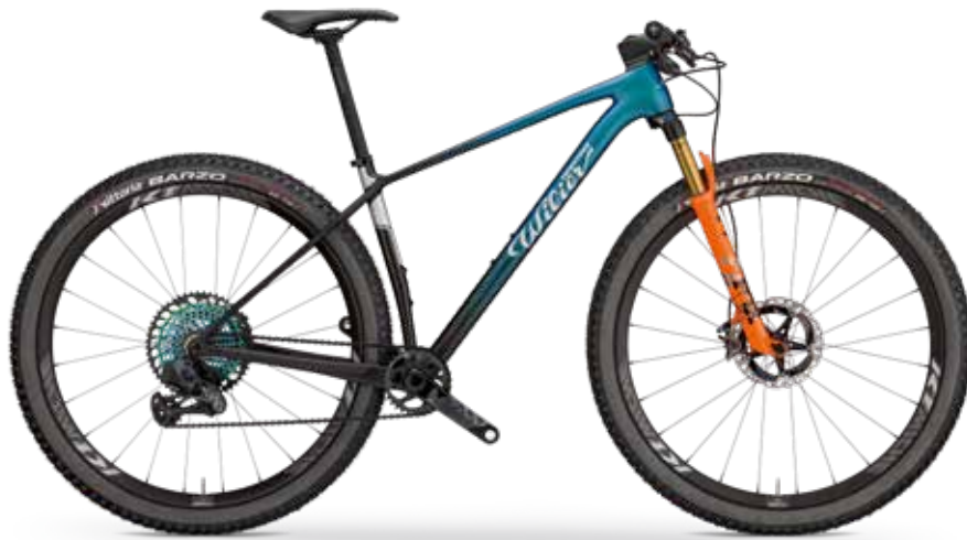
BLUE, BLACK; MATT - COLOR CODE U5

┌┐ URTA INTEGRATED CARBON BAR 285 G ± 5%