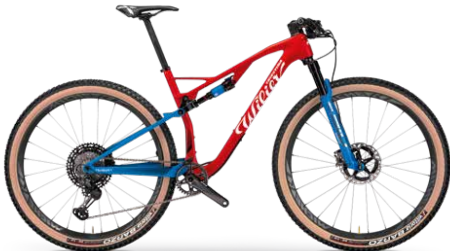
RED, BLUE; GLOSSY - COLOR CODE U2