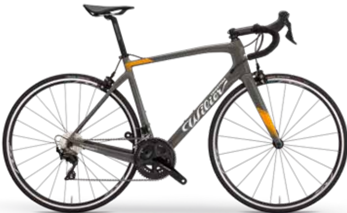
GREY, ORANGE; GLOSSY - COLOR CODE G39