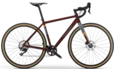
BOURDEAUX, GREY, ORANGE; MATT - COLOR CODE J21 NEW COLOR