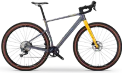
GREY, YELLOW; GLOSSY - COLOR CODE C6