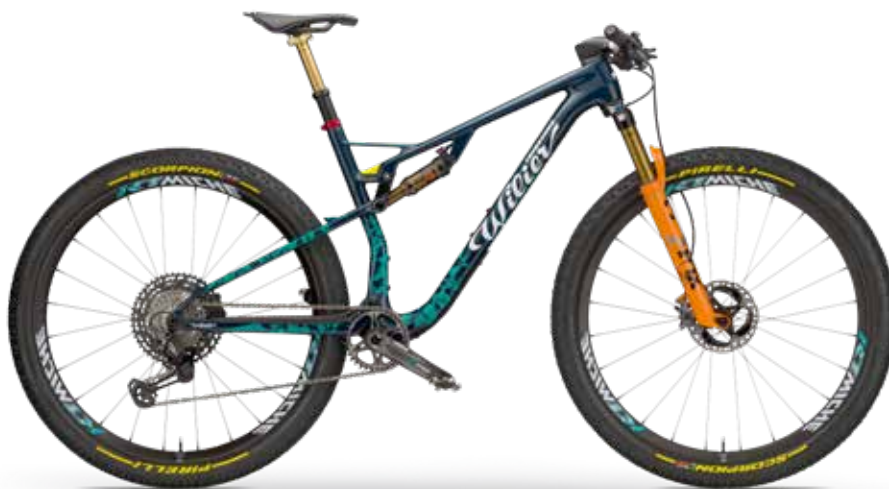
WILIER PIRELLI; GLOSSY - COLOR CODE U10

┌ URTA MAX INTEGRATED CARBON BAR - 285 G ± 3%