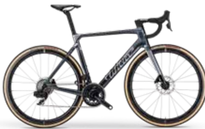
MOON GREY; GLOSSY - COLOR CODE F10 NEW COLOR