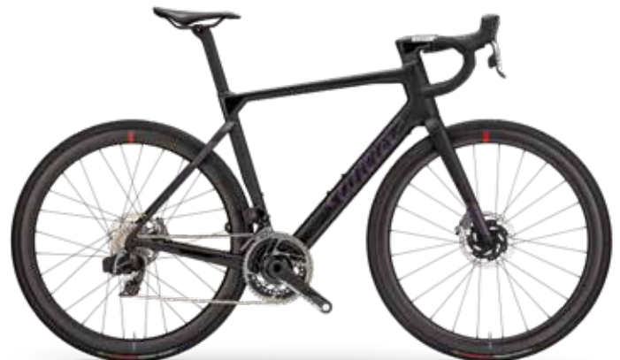
IRIDE BLACK; MATT & GLOSSY - COLOR CODE Y17