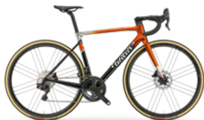
RAMATO; GLOSSY - COLOR CODE E12