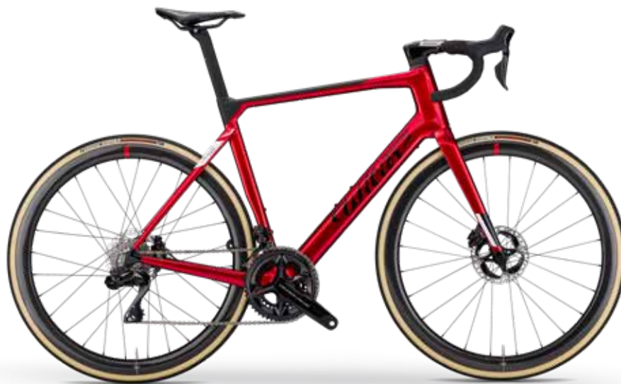
VELVET RED; GLOSSY - COLOR CODE Y19 NEW COLOR

CARBON MONOCOQUE HUS-MOD - 1100 G ± 5% CARBON MONOCOQUE HUS-MOD - 360 G ± 5% FILANTE HY INTEGRATED CARBON BAR 350 G ± 5% MAHLE X20 & IX250 BATTERY, 236 WH MAHLE PULSAR ONE