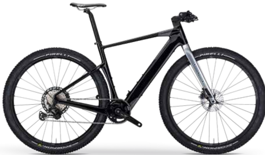
BLACK, GREY; GLOSSY - COLOR CODE Y23