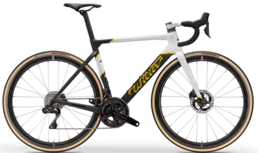
TDF23 - COLOR CODE F13 NEW COLOR