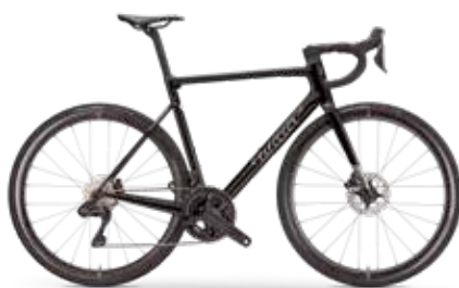
BLACK, GREY; GLOSSY - COLOR CODE E13