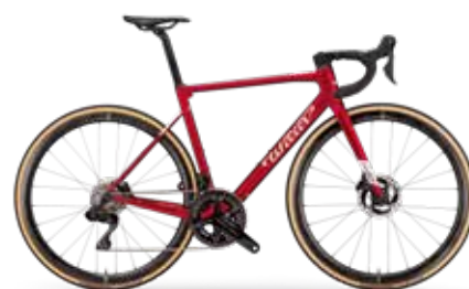
VELVET RED; MATT - COLOR CODE E3