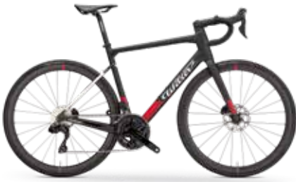
BLACK, RED; MATT - COLOR CODE G36