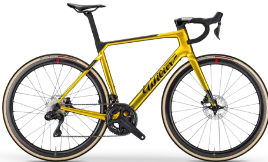
GOLD BLACK; GLOSSY - COLOR CODE Y20 NEW COLOR