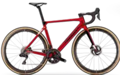
VELVET RED; GLOSSY - COLOR CODE F1