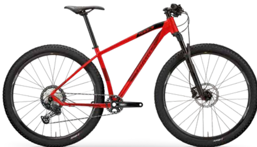
RED; MATT - COLOR CODE L16

▾ ALU 6061, THRU-AXLE REAR DROPOUT 12 mm