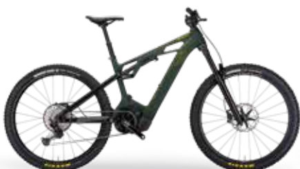
GREEN; GLOSSY - COLOR CODE P15