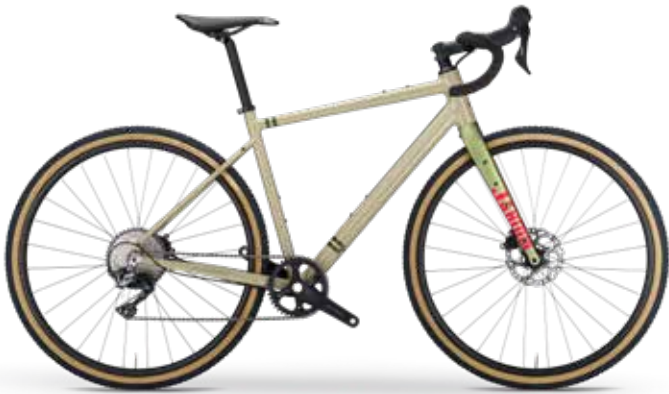
SAND, GREEN; GLOSSY - COLOR CODE J24 NEW COLOR