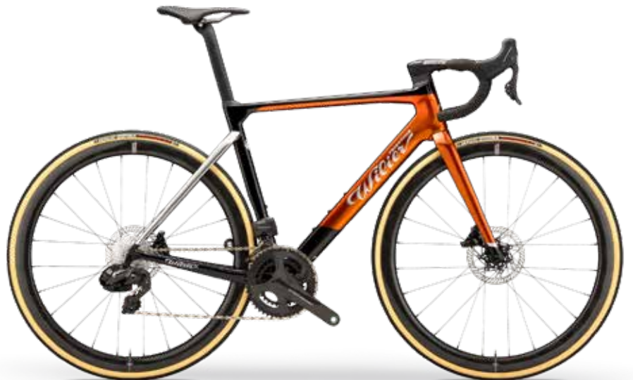
RAMATO; GLOSSY - COLOR CODE F8 NEW COLOR