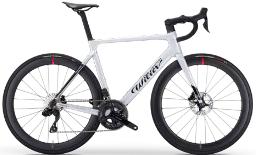
SILVER, BLACK; GLOSSY - COLOR CODE F12