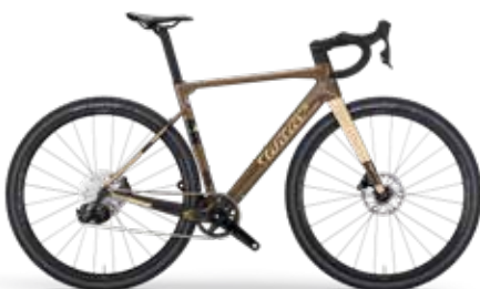
BROWN, SAND; GLOSSY - COLOR CODE V6