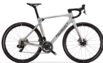
FADED SILVER, EMERALD; GLOSSY - COLOR CODE R9