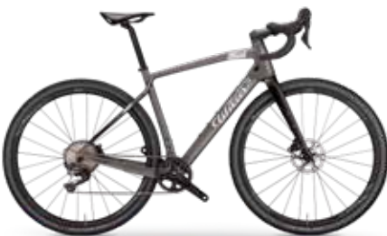
SMOKEY; MATT - COLOR CODE J20