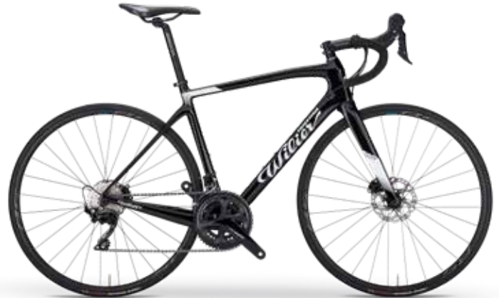
BLACK, WHITE; GLOSSY - COLOR CODE G38