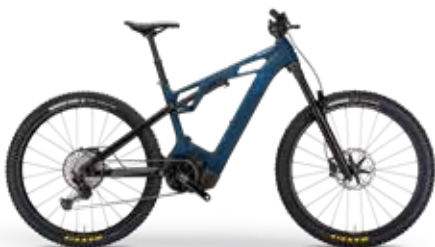
BLUE; GLOSSY - COLOR CODE P14