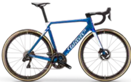
AZZURRO ITALIA; GLOSSY - COLOR CODE F14 NEW COLOR