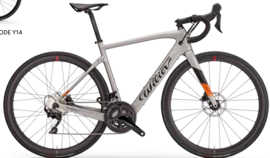
GREY, BLACK, ORANGE; MATT - COLOR CODE Y13