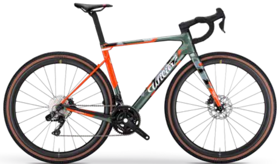
CAMOUFLAGE, ORANGE; GLOSSY - COLOR CODE V4