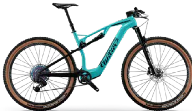
AQUAMARINE; GLOSSY - COLOR CODE U8