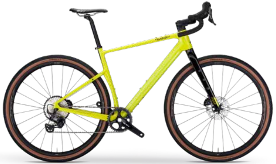
LIME, BLACK; GLOSSY - COLOR CODE C7