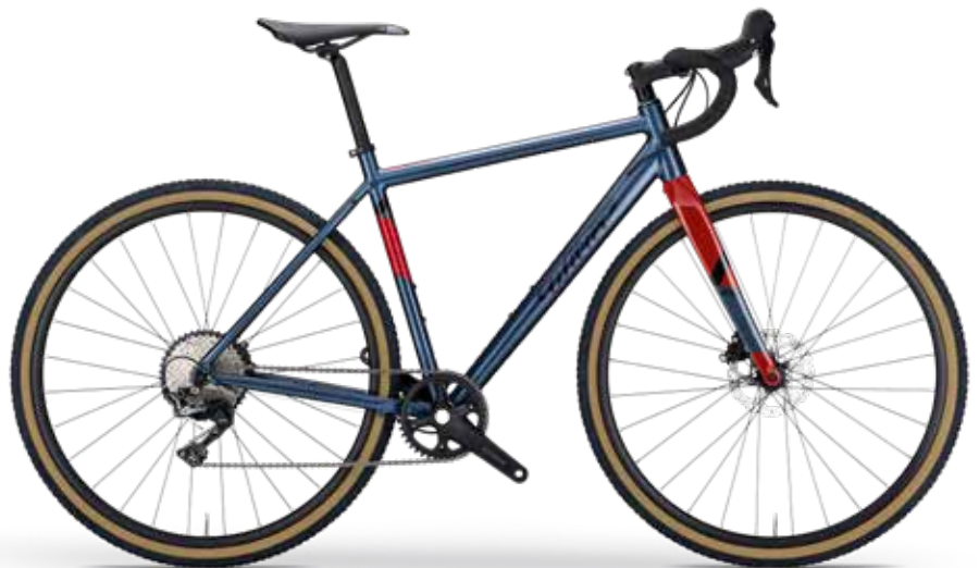
STEEL BLUE, RED, BLACK; GLOSSY - COLOR CODE J23 NEW COLOR