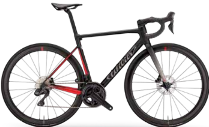
BLACK, RED; MATT - COLOR CODE E8