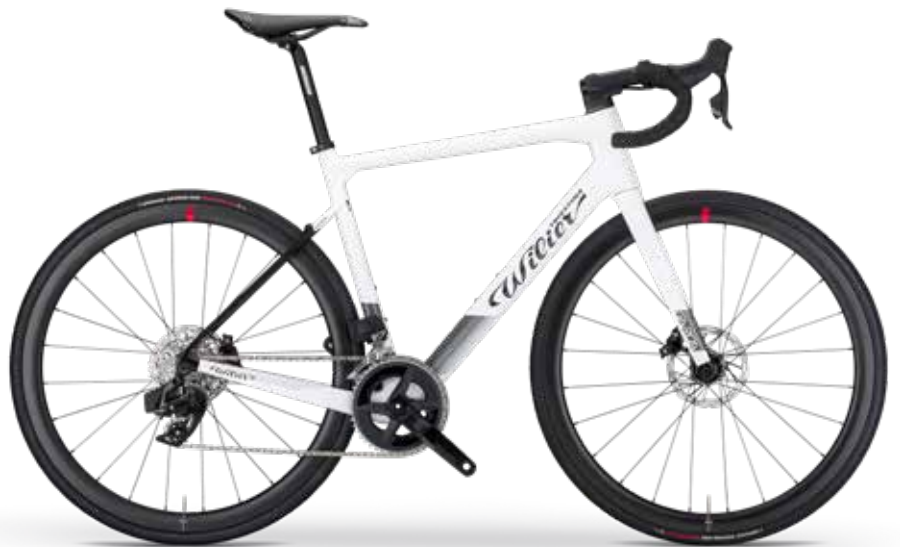
WHITE, BLACK; GLOSSY - COLOR CODE G40 NEW COLOR