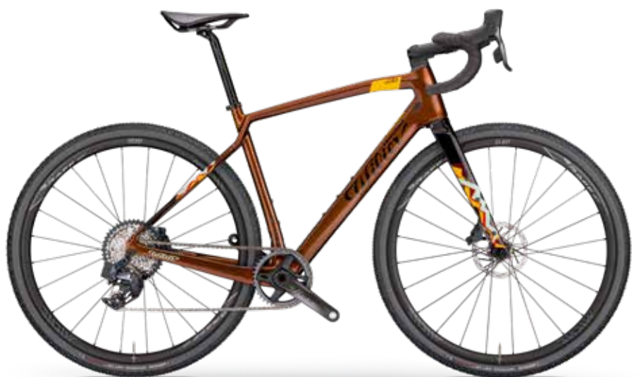
PATTERNED BRONZE; GLOSSY - COLOR CODE J18