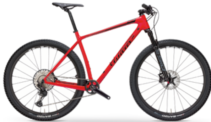
RED, BLACK; GLOSSY - COLOR CODE X15