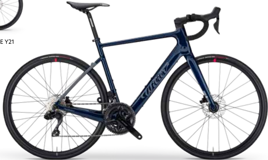
BLUE, GREY; GLOSSY - COLOR CODE Y22