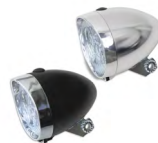
LED FRONT LIGHT