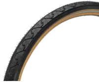
26" REAR TIRE