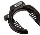
ABUS AMPARO 4850