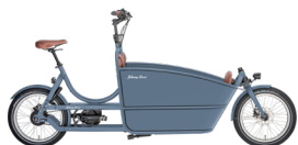
Matte Earl Grey