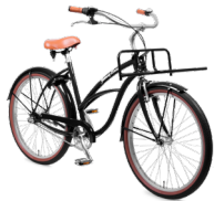
Dutch Delight ♂