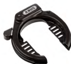
ABUS AMPARO 4850