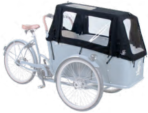
RAINCOVER DELUXE 2.0