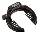
ABUS AMPARO 4850