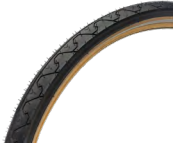
24" FRONT TIRE